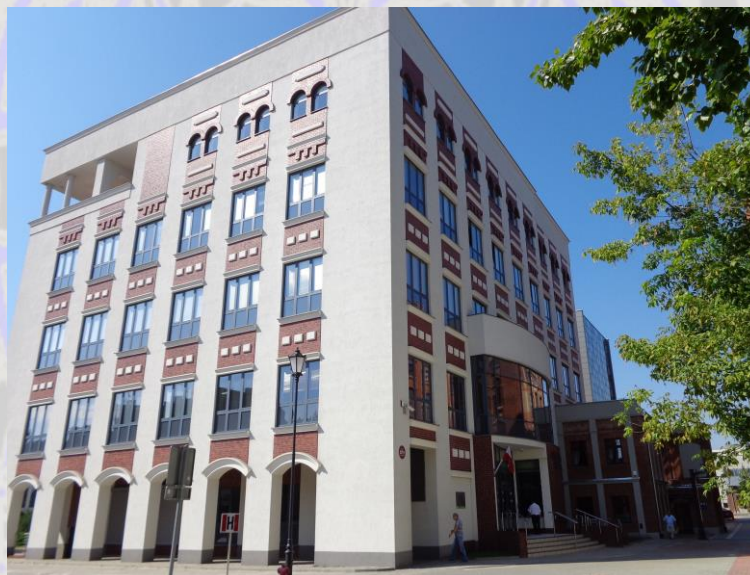
Conference venue: Information Technology Centre Lodz University of Technology

Conference papers will be edited as a monograph.